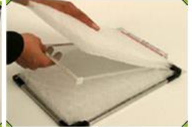
Insert new media pads

WARNING ELECTRIC SHOCK NEVER OPEN UNIT BEFORE UNPLUGGING. DISCONNECT ALL POWER DO NOT IMMERSE POWER HEAD IN ANY FLUID