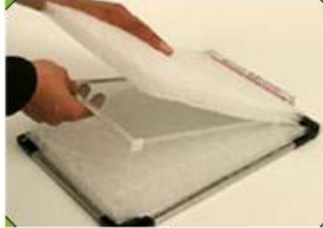
Remove old media pads